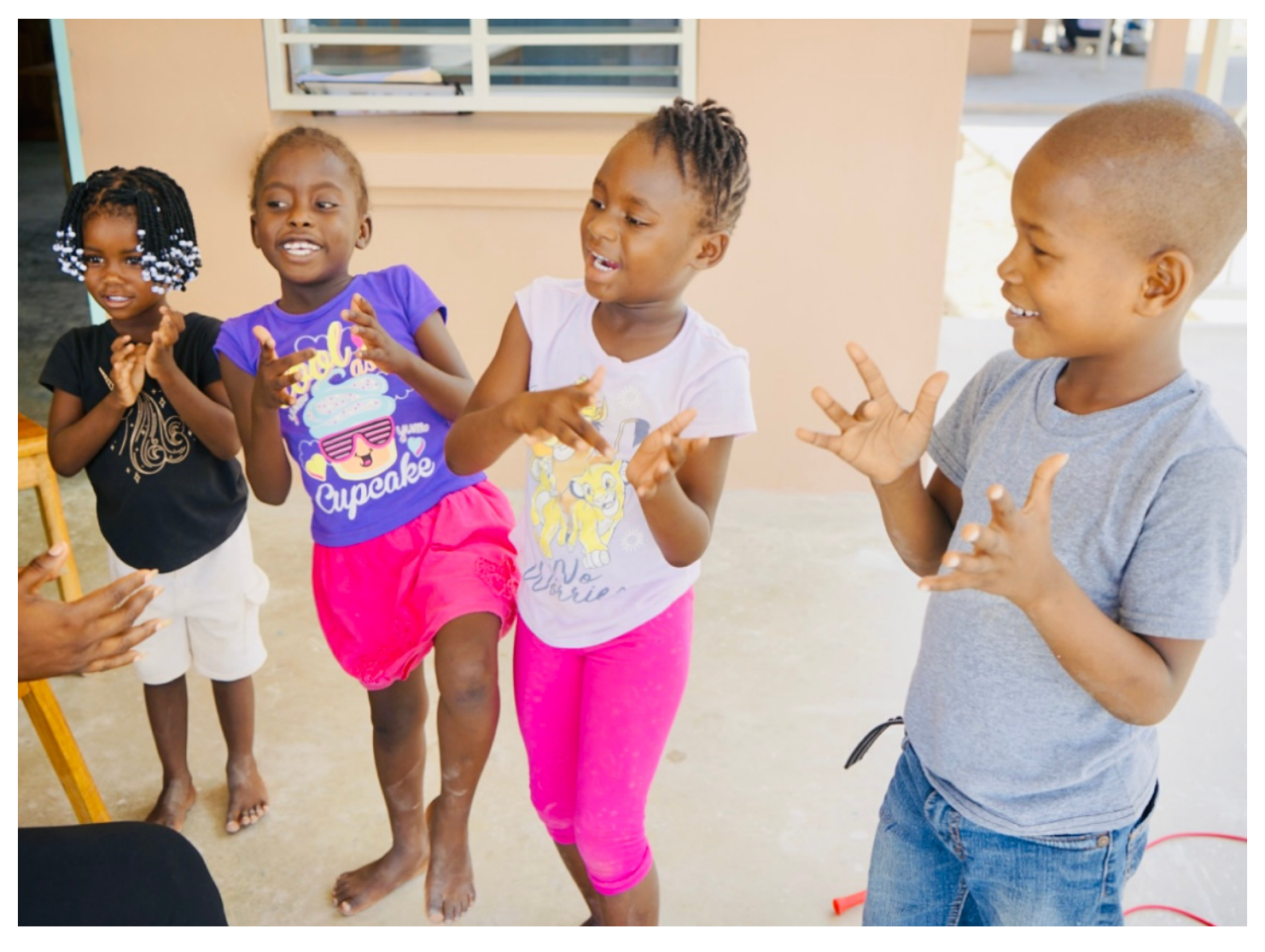
(first photo: Kenya, second photo: Haiti)